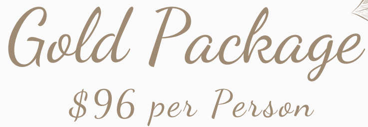
Table Numbers, Linen Tablecloths and Napkins

Welcome Station with Lemonade, Iced Tea, and Water